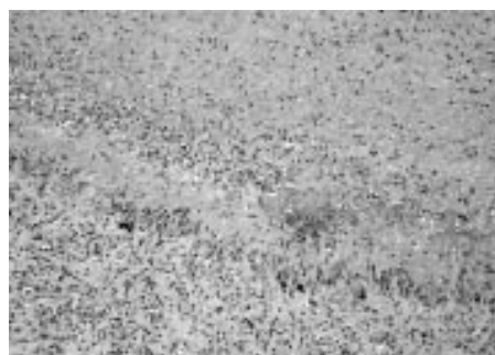
Figure 3 The nodule is composed of necrotic material, surrounded by a rim of palisaded histiocytes merging with fibroinflammatory tissue (haematoxylin and eosin stain).